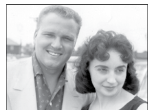
Dedicated to Mom & Dad